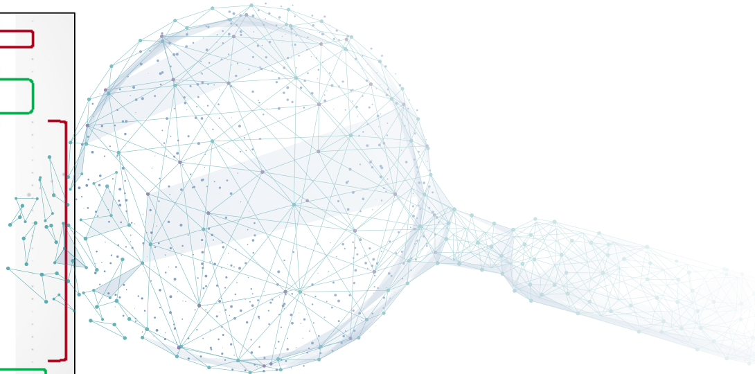
Figure 2. Example of FEC testing

System tests need to change as new measurements are required to support 400G, PAM4, and FEC. The key measurements affected by FEC test implications include the transmitter (output) and receiver (input) burst error counting and analysis. Testing with stressed FEC-encoded data and measuring BER in links that do not by design run error-free is also important.