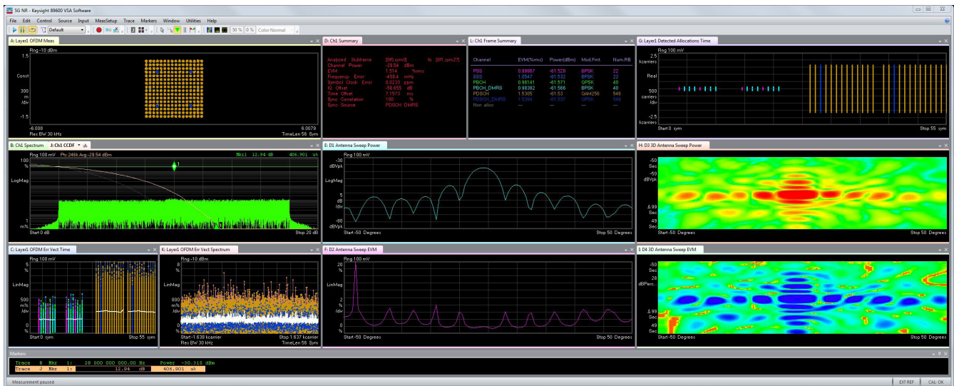
Figure 3. Analysis of a 5G NR 256 QAM signal with antenna pattern

Proper selection of test equipment, connectors, adapters, and system-level calibration enables high-performance measurements to evaluate the true performance of 5G components or devices. Figure 3 shows a calibrated measurement of a 5G antenna using Keysight's 5G R&D Test Bed solution. It enables characterization of 5G NR devices from RF to mmWave frequencies with precision and modulation bandwidths up to 2 GHz. 5G NR-compliant software lets you easily create and analyze waveforms with 5G numerology, uplink, and downlink to test 5G NR and LTE integration and coexistence.